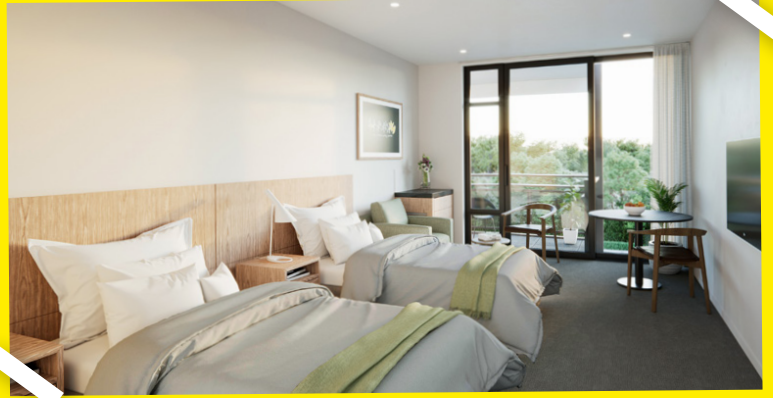
Impression of an accommodation room in the new cancer centre.