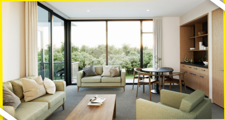
Impression of one of the centre's whānau rooms.