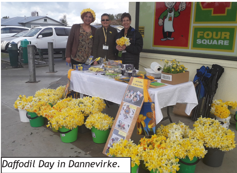
Daffodil Day in Dannevirke.