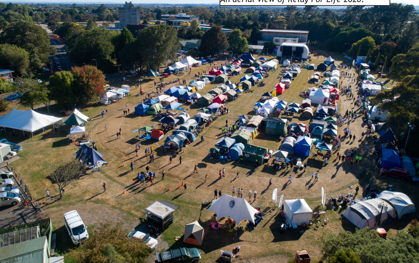
An aerial view of Relay For Life 2020.