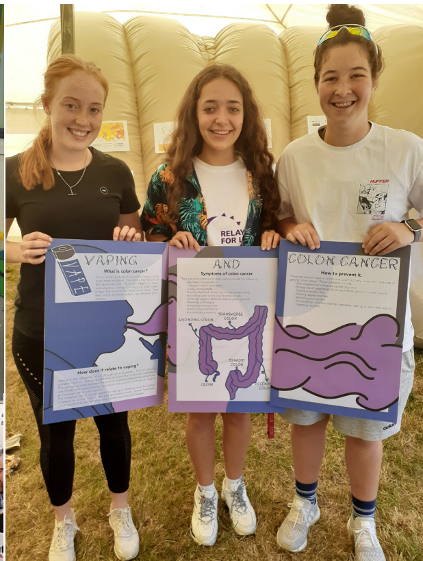
Left: The Māori cancer community hui. Above: Palmerston North Girls High Health Hub entry at RFL.