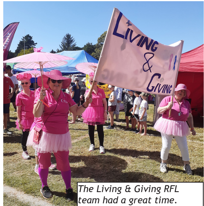
The Living & Giving RFL team had a great time.