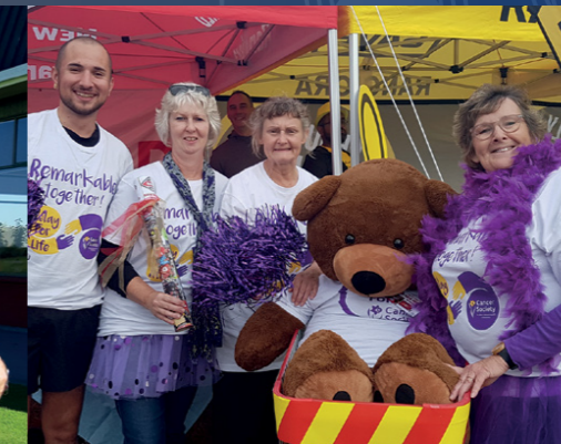
At Relay For Life, North Canterbury