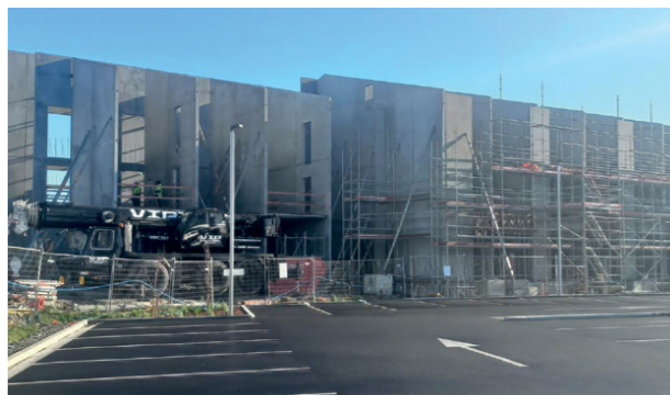
Progress on our new building in Langdons Rd

Financially we have continued to be impacted by Covid and investment income was affected by low interest rates. We were however well supported by bequest income which accounted for around a third of our income for the year. We are very grateful to those who choose to include the Cancer Society in their will, leaving a legacy that will support our ongoing work across the community. We are working hard to diversify our funding streams to ensure we are well positioned to respond to increased demand for our services and adverse external factors.