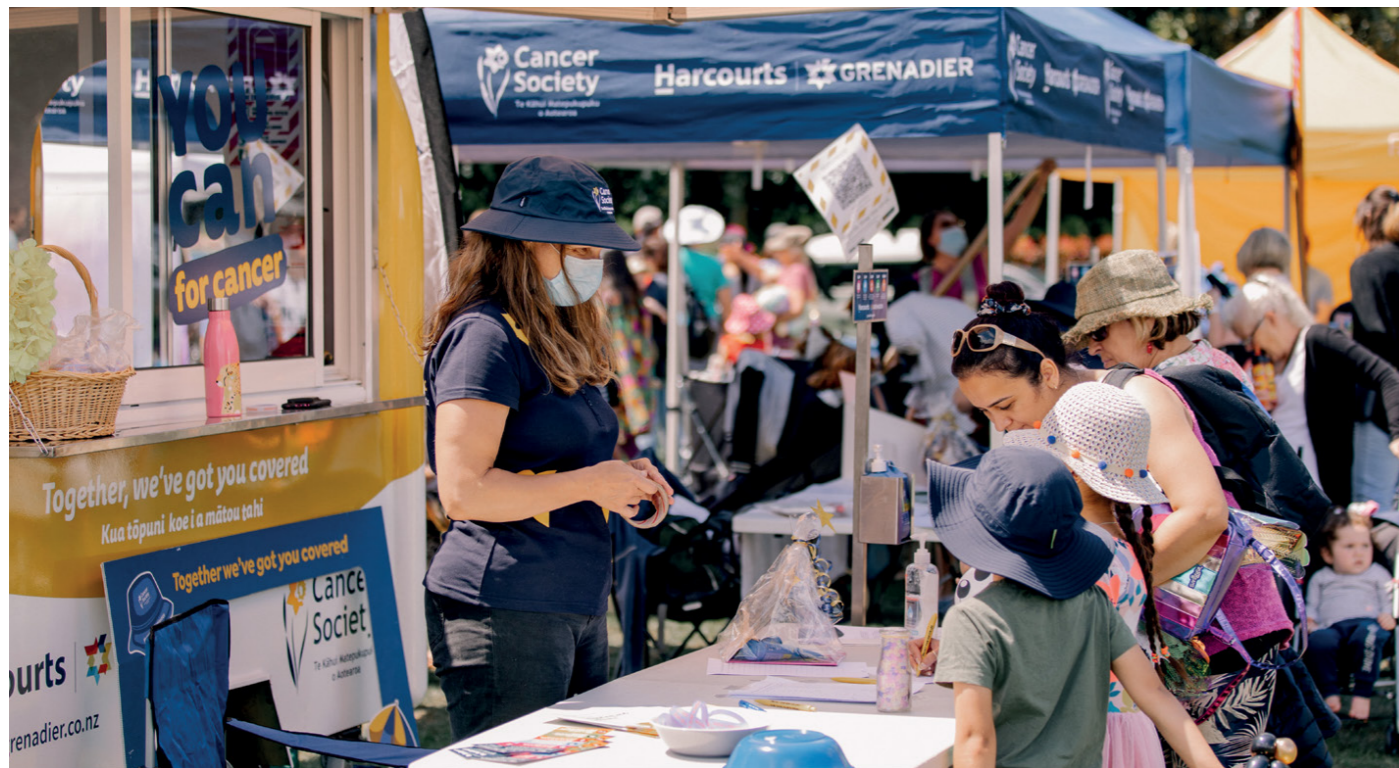
Promoting SunSmart behaviour at the Teddy Bear's Picnic